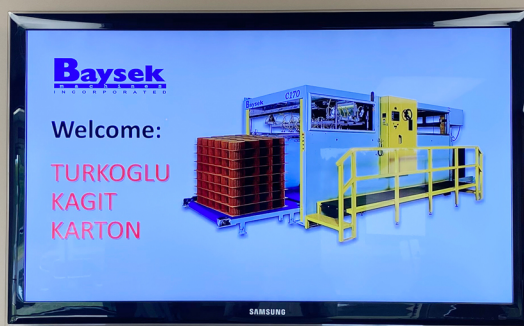
Nelsonville, Wisconsin based Baysek Machines virtually welcomed Turkoglu Kagit Karton in Istanbul, Turkey.

Like other companies in the industry and the world, Baysek had plans for 2020. SuperCorrExpo 2020 was where the company planned to unveil a new digital post printer for corrugated and industrial boxes. They were also gearing up to take a third C-170 die cutter to Munich, Germany, CCE International March of 2021. (To date, CCE has not been cancelled so it remains a "wait and see"). Upon world travel restrictions this spring and summer, and the Wisconsin state "Safer at Home" act, Baysek Machines im-